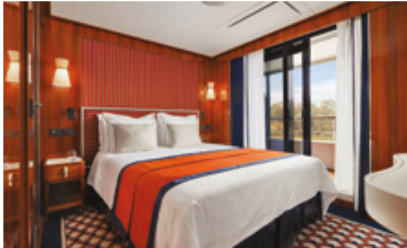
NS | NAVIGATOR | 465 SQ. FT.

Breathe easy in our most spacious suite. Generous, double floor-to-ceiling glass sliders with ocean views create the perfect balance of indulgent nights aboard after thrilling days ashore.