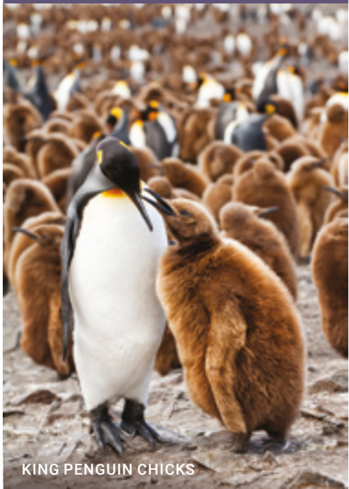
KING PENGUIN CHICKS

BOOK A SUITE AND CHOOSE TWO BOOK BY SEPTEMBER 30