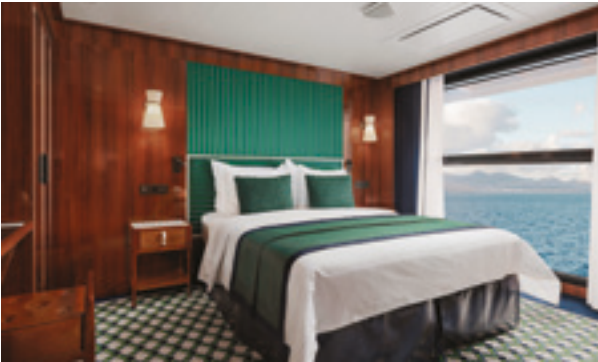
E1 | HORIZON DELUXE | 300 SQ. FT.

HORIZON DELUXE | VERANDA DELUXE | HORIZON | VERANDA | ADVENTURE OCEANVIEW