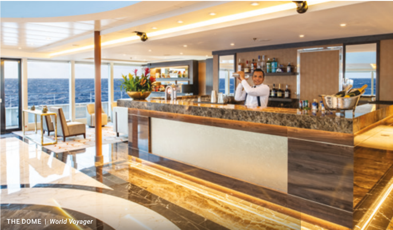
THE DOME | World Voyager