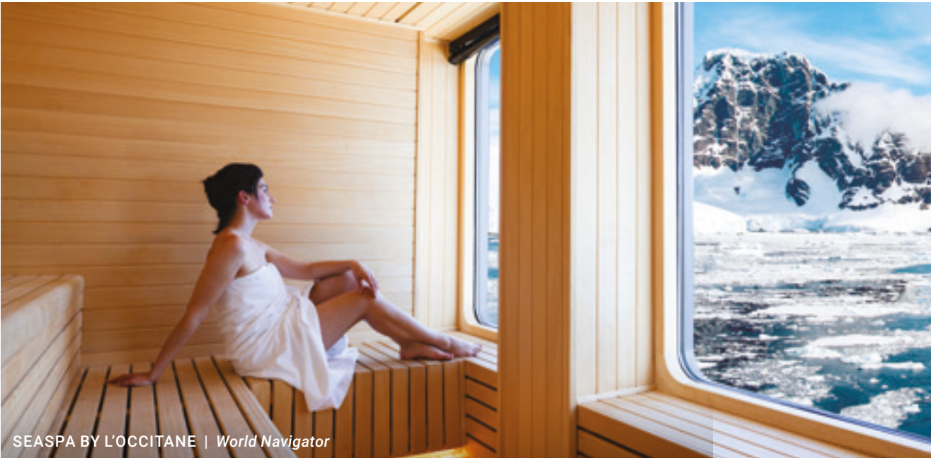
SEASPA BY L'OCCITANE | World Navigator