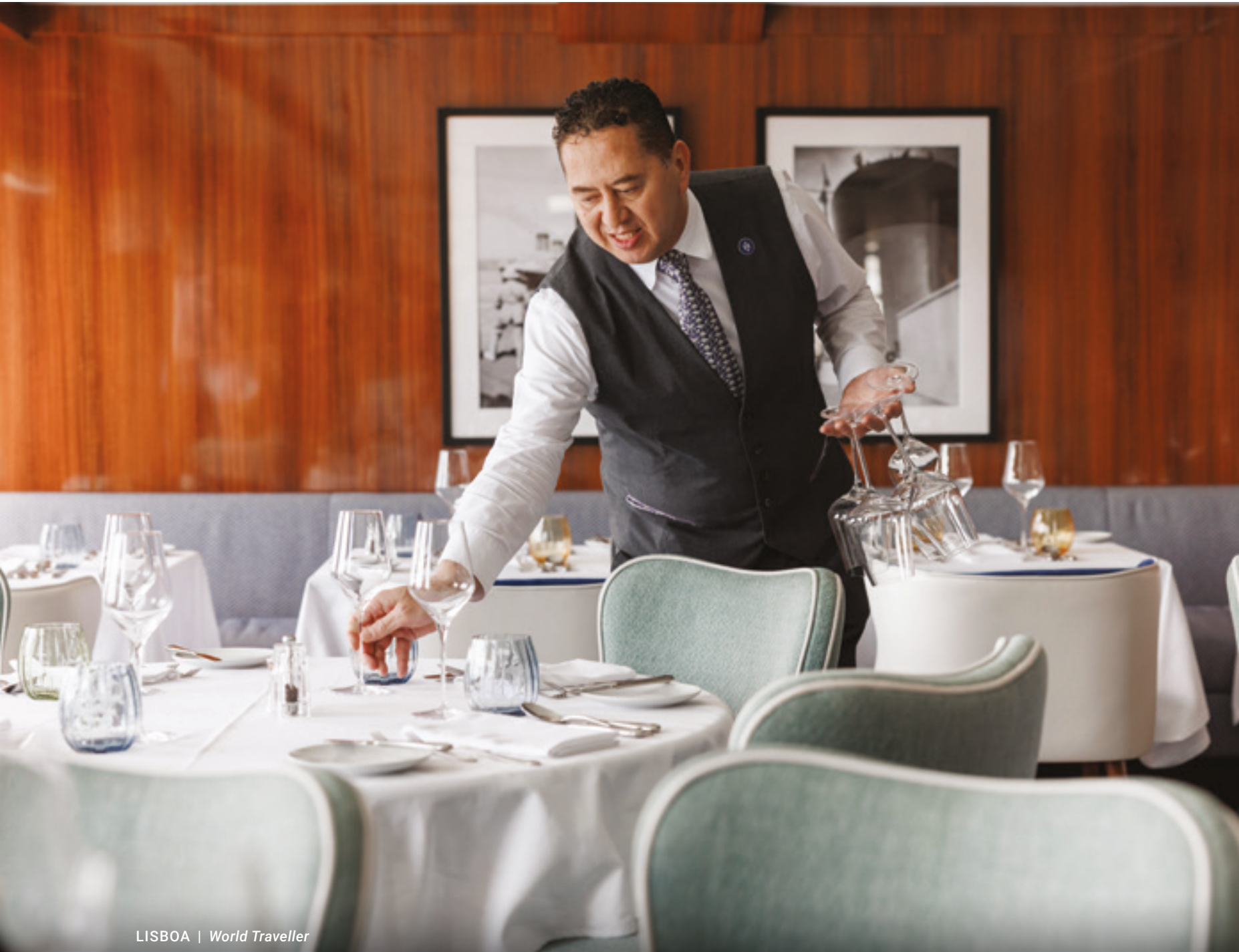
LISBOA | World Traveller