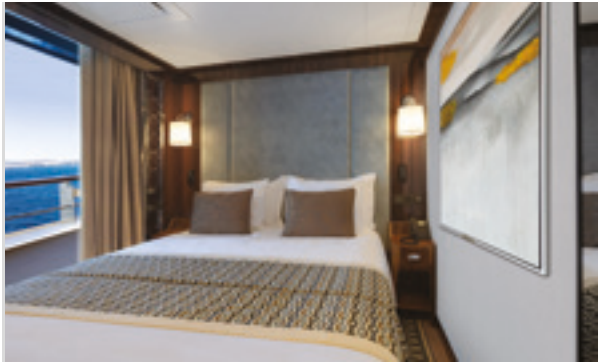
E2 | VERANDA DELUXE | 300 SQ. FT.

The Horizon Deluxe stateroom delivers impressive views and refreshing ocean breezes from its floor-to-ceiling windows with a top-drop Juliette balcony. Get swept away in the magnificent blue sky and sea in every direction.