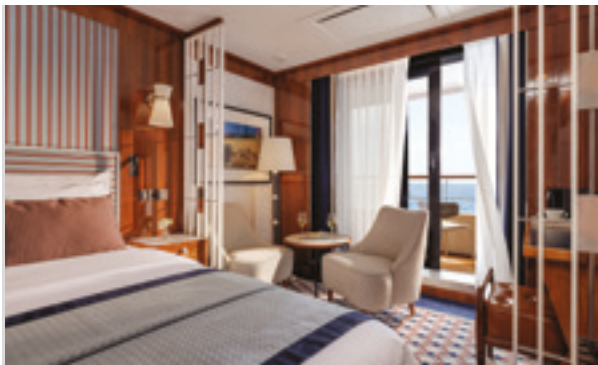
B1/B2 | VERANDA | 270 SQ. FT.

From your spacious sitting area with a sofa, chairs and a vanity, look out over the ocean vistas through the floor-to-ceiling windows of your Juliette balcony with top-drop electric window. Relax and recharge in lavish comfort.