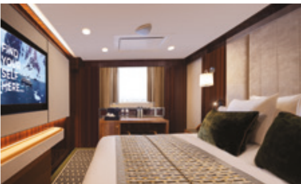
AO | ADVENTURE OCEANVIEW | 183 sq. ft.

A sitting area with chairs and a vanity opens onto a private walk-out balcony with comfortable teak furnishings in the Veranda Stateroom. Take in the captivating views as you relax indoors or outside.