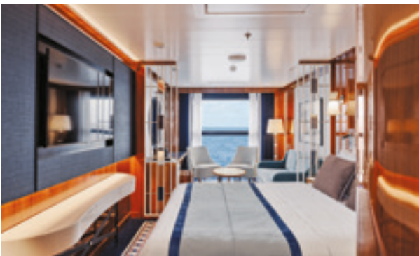
A1/A2 | HORIZON | 270 SQ. FT.

Start and end your day on a generously sized balcony with rich, teak furnishings. Salt and sea breeze from your walk-out balcony are the perfect complement to a morning coffee or evening nightcap.