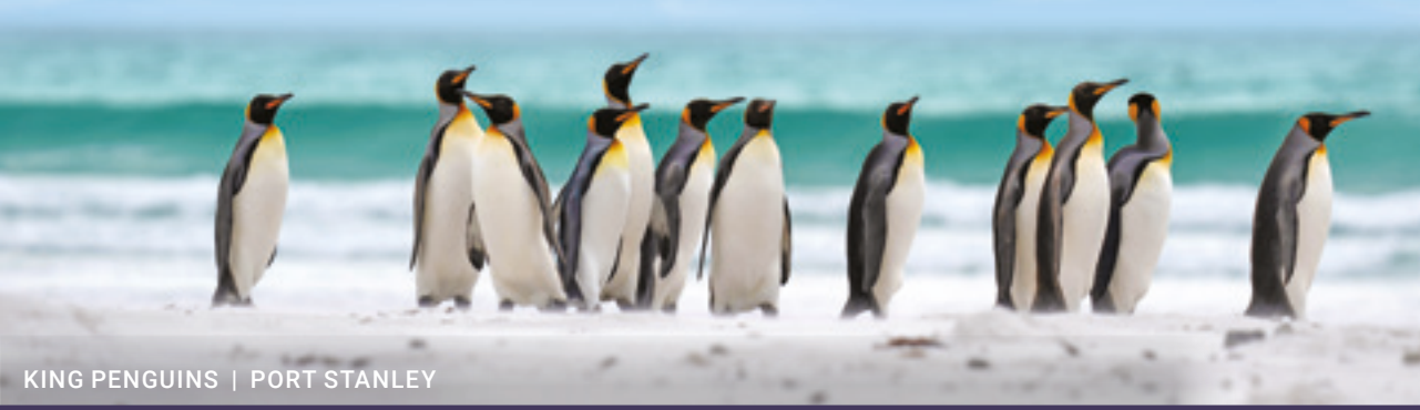
KING PENGUINS | PORT STANLEY

Experience a birdwatcher's paradise in the Falklands and Chilean Fjords. On West Point Island, black-browed albatrosses soar high above and rockhopper penguins waddle. On Saunders Island, you may catch some Gentoos surfing the waves. From Punta Arenas, the whimsical Magellanic penguins of Magdalena Island beckon. The Garibaldi Glacier sets the scene for Southern giant petrels in flight, their nearly 8-foot wingspan. It's a world of wonder that brings wildlife and explorer spirits together.