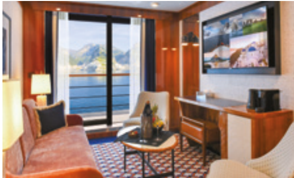
DS | DISCOVERY | 445 SQ. FT.

Breathe easy in our most spacious suite. Generous, double floor-to-ceiling glass sliders with ocean views create the perfect balance of indulgent nights aboard after thrilling days ashore.