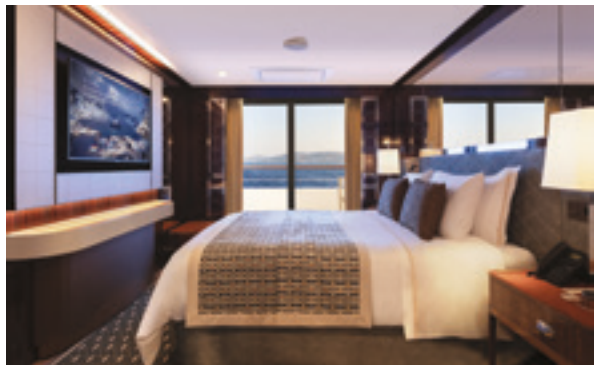
JS | JOURNEY | 382 SQ. FT.

The Discovery suite is your personal haven while sailing to your next destination. Step from your plush bedroom or comfortable living room onto your furnished private balcony as you anticipate what new adventures await.